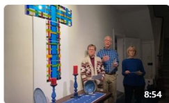
Coronavirus National Moment of Unity and Remembrance

Virtual Worship has expanded our reach beyond our current members to past members who've moved away and visitors alike. Available at 10am on Sundays and then anytime on Facebook page. We've had viewers from 21 states and 7 different countries!