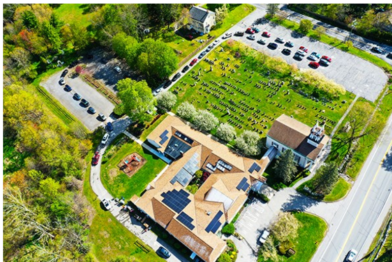
Aerial footage of our twice monthly drive-thru pantry distributions.