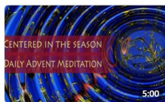
Centered in the Season, December 25