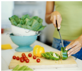
Volunteers needed to provide meals for our neighbors in Peekskill